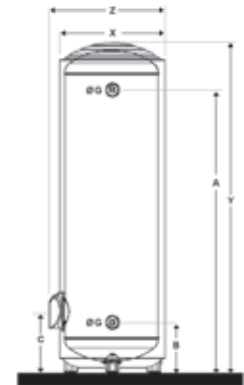
> Floor standing